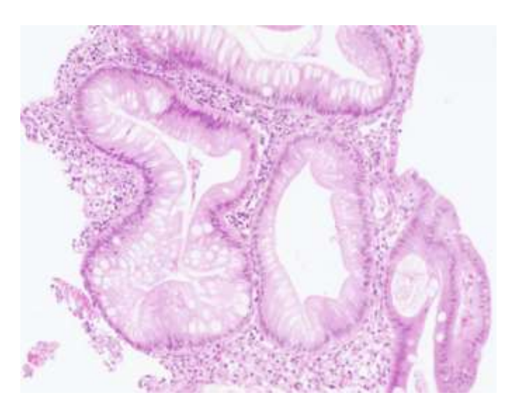
Figure 3 shows focal areas of ulceration with an expansion of the lamina propria and diffuse mononuclear inflammatory infiltrate including lymphocytes, plasma cells, few eosinophils, neutrophil polymorphs, and focal cryptitis. There is submucosal oedema, but no granuloma is seen.